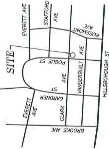
VICINITY MAP (N.T.S.)

LEGEND ○ EXISTING IRON PIPE ● NEW IRON PIPE X COMPUTED CORNER NOTE: THIS PROPERTY DOES NOT LIE WITHIN 2000' OF A N.C.G.S. MONUMENT. THIS SURVEY IS OF AN EXISTING PARCEL OR PARCELS OF LAND. ALL CREEKS, EASEMENTS, BUFFERS, FLOOD LIMITS & SETBACKS TAKEN FROM BOM 1926, PG 08